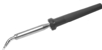
IRON 830 / 30W