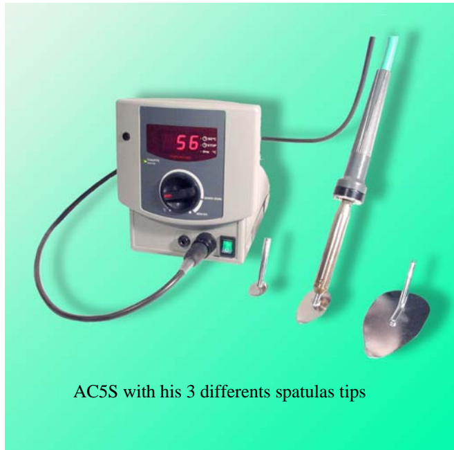
AC5S with his 3 differents spatulas tips

AC5S is a special Appliance designed for repairing, reworking...in a large field of Works as: